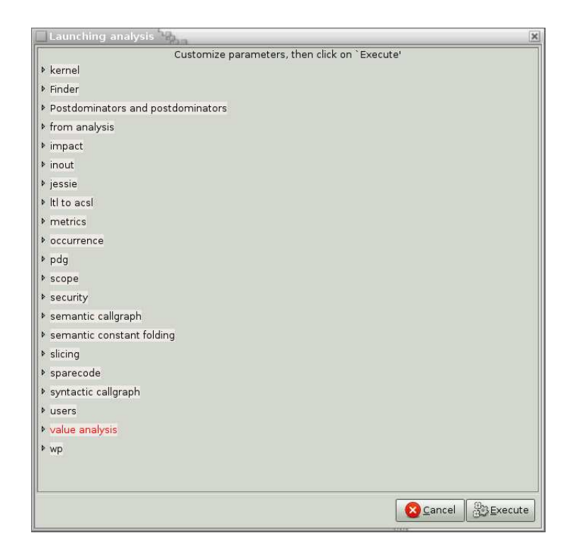
Figure 8.2: The Analysis Configuration Window