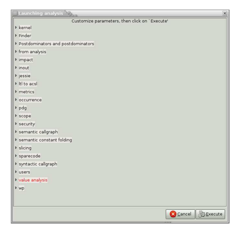
Figure 8.2: The Analysis Configuration Window

• Item Configure and run analyses opens the dialog box shown Figure 8.2, that allows to set all Frama-C parameters and to re-run analyses according to changes.