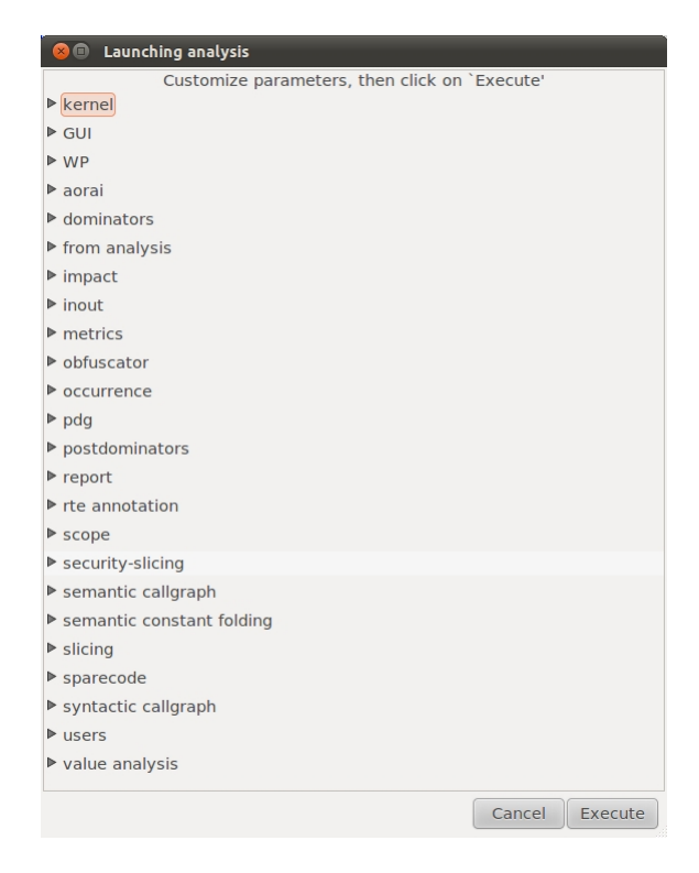
Figure 9.2: The Analysis Configuration Window

• Item Configure and run analyses opens the dialog box shown Figure 9.2, that allows to set all Frama-C parameters and to re-run analyses according to changes.